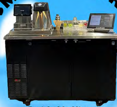
Perishable Mixers Storage System Automated Cocktail Dispensing System