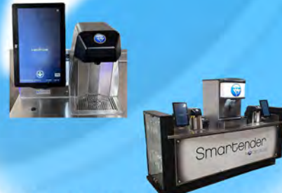
SELF-SERVE MADE EASY