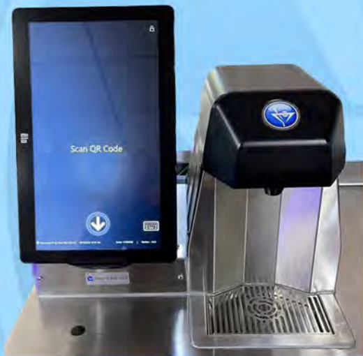
Smartender® Self-Serve (Single)

Available in mounted and portable configuration packages including single and twin head dispenser and terminals.