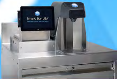
Automated Cocktail Dispensing System