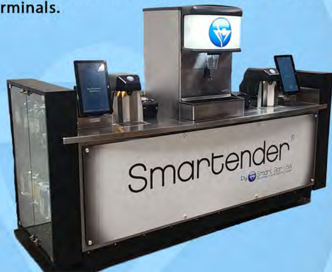
Smartender® Self-Serve DUO (Twin Head)